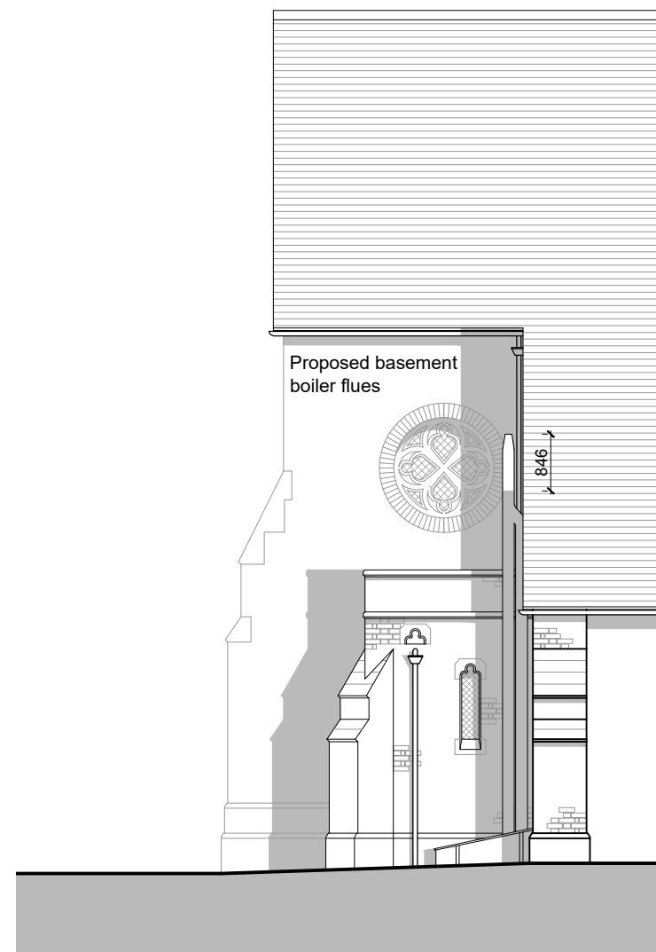
Proposed West Elevation - (Front of Church) Scale 1:100 @ A3